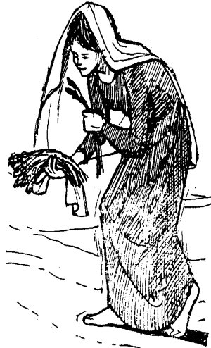
A poor widow

Jesus compared the teacher of the Law with a poor widow. Put (T) teacher and (W) widow against the things Jesus pointed out.