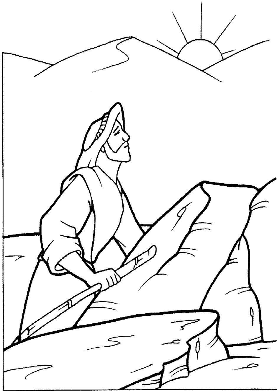
JESUS IS TEMPTED

Listen carefully to the Gospel reading so you can unscramble the words in the right column to complete the Gospel Lesson.