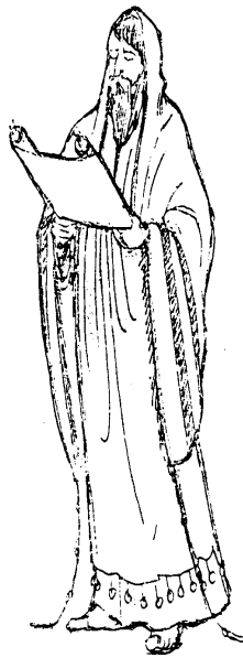
A teacher of the Law