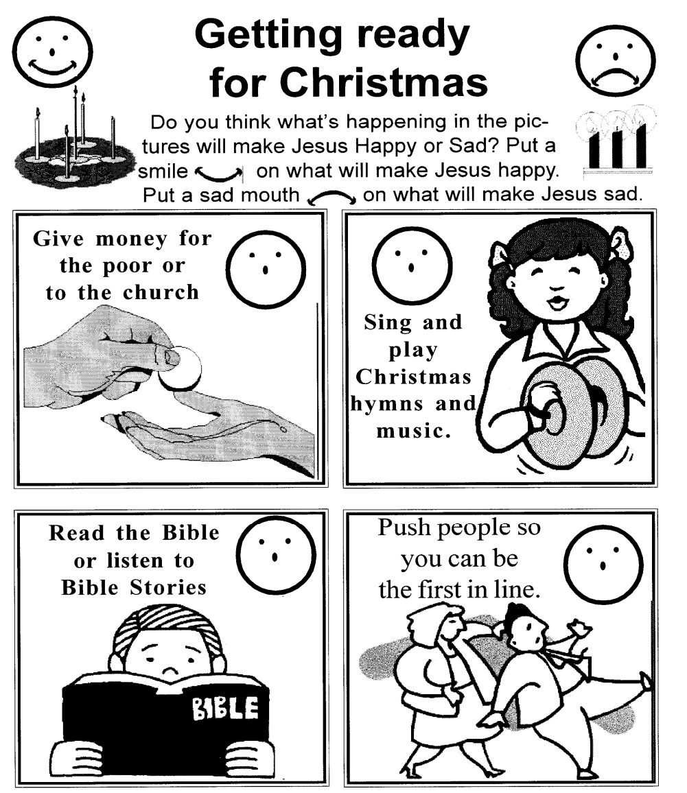
Prepared and freely distributed by The Diocese of North Queensland Ministry Development Officer PO Box 1244 Townsville QLD 4810

Important note: These workbooks are freely provided and should not be altered in any way, nor are they to be sold or used in any commercial setting.