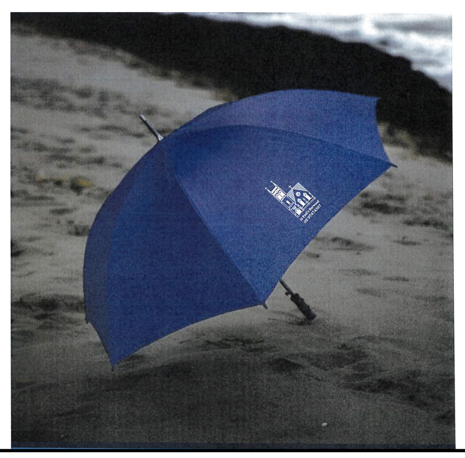
$30 Golf Umbrella And $20 for Small Collapsible Umbrella All monies go to St Paul's