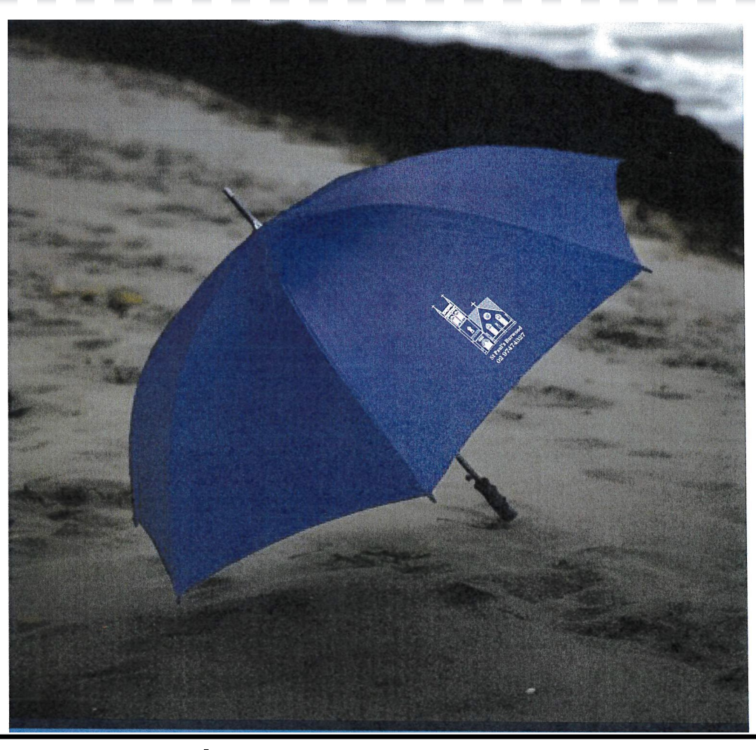
$30 GOLF UMBRELLA All monies go to St Paul's

For more info, please go to www. Sydneyu3a.org